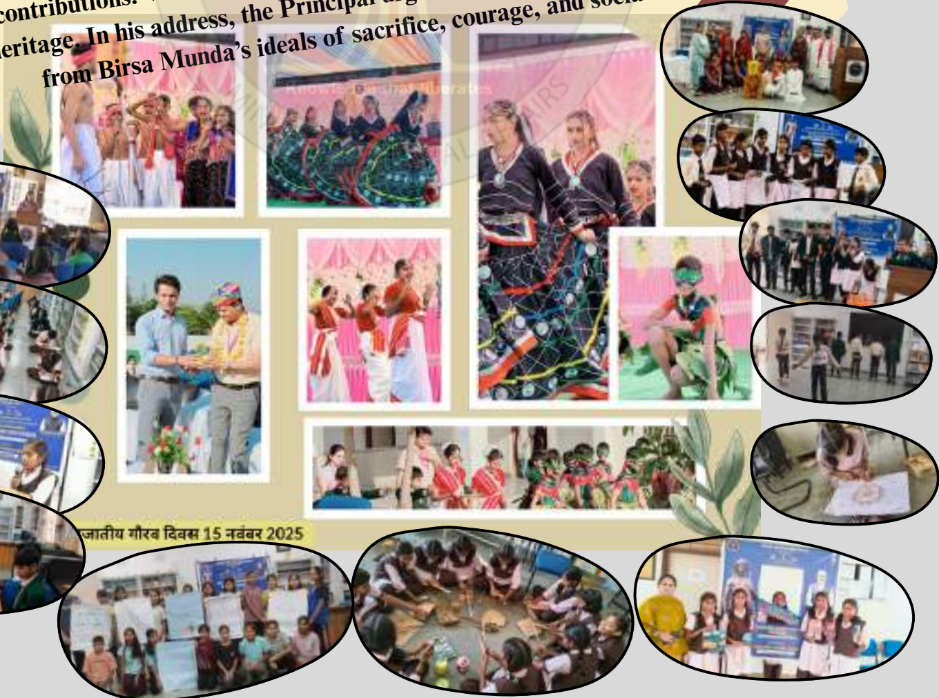
जातीय गौरव दिवस 15 नवंबर 2025